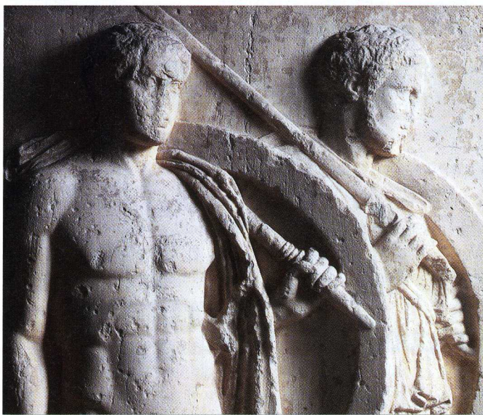
During the Peloponnesian War, Athenians erected monuments to soldiers killed in battle.

After the Peloponnesian War, Greece was politically unstable. First Sparta and then Thebes tried to control all of Greece. They were defeated and wars between the city-states continued. Many Greeks felt that only a foreign power could unite Greece. It would be many years before this would come to pass. However, Greek civilization still made great advances during this time.